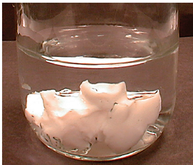
Krytox™ grease in hydrocarbon solvent is not dissolved.