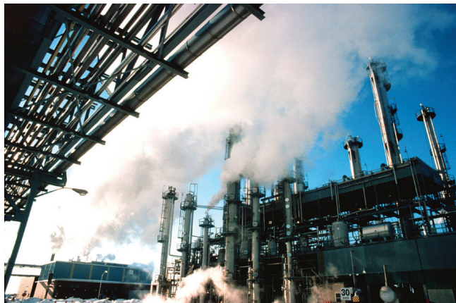
Krytox™ XHT greases can be used in many industrial applications in extreme thermal conditions.