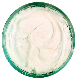
In oven at 232 °C (448 °F) for 40 hr: Krytox™—0% wt loss