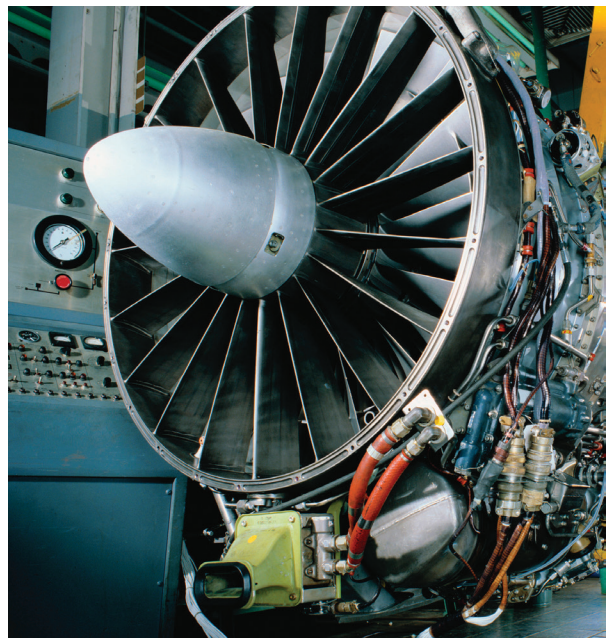
Krytox™ XHT Grades: Extreme Conditions, Extreme Performance

Krytox™ XHT greases are available with useful temperature ranges up to 360 °C (680 °F) for continuous use, with spikes to 400 °C (752 °F), when used in proper metallurgy with periodic re-lubrication.