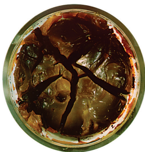
In oven at 232 °C (448 °F) for 40 hr: Hydrocarbon—40% wt loss